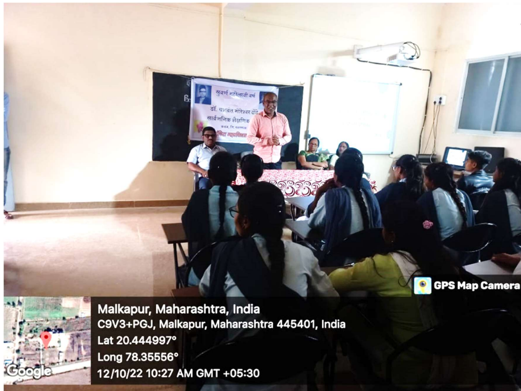
Expert Delivering Lecture on English Proficiency, Date: 12/10/2022